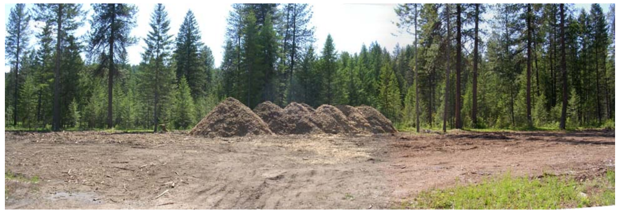
Figure 5: Slash ground into a uniform product ready for transportation to the biomass facility