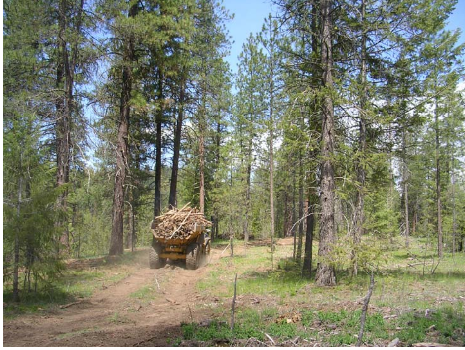
Figure 2: Hauling the load – increasing distances substantially increase the cost of removal