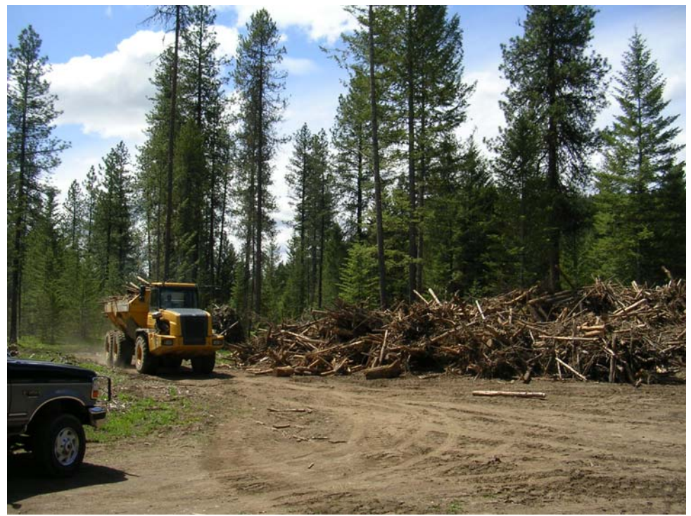
Figure 3: Residual pile at the main processing deck