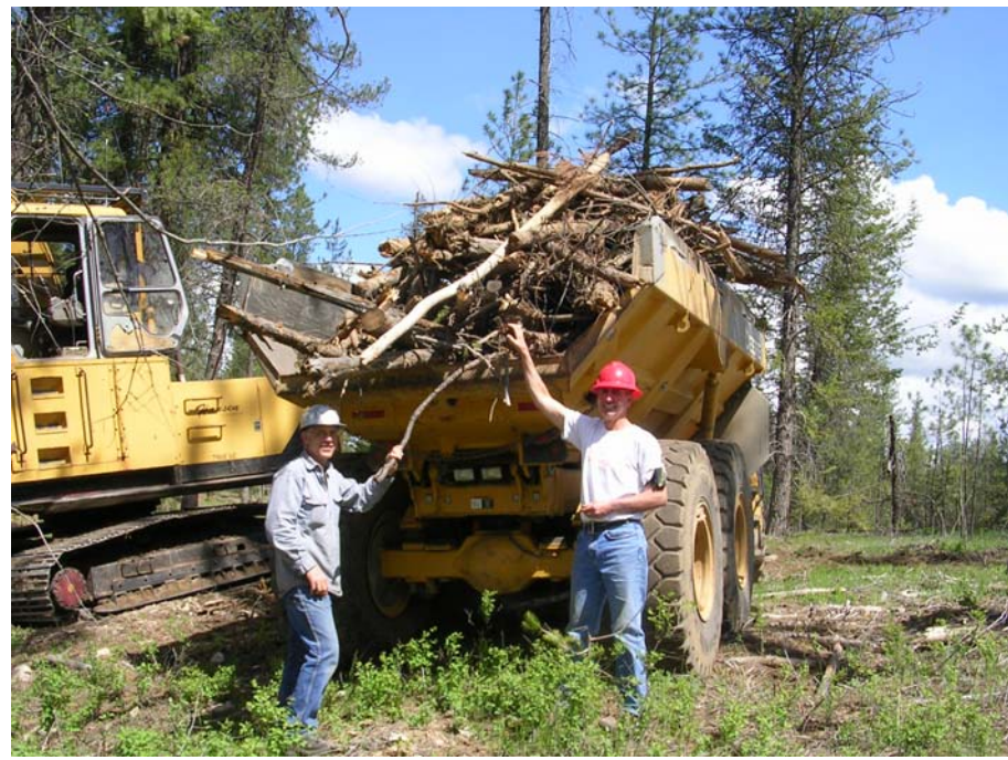
Figure 1: A load of harvest residue ready for transport to the main processing location