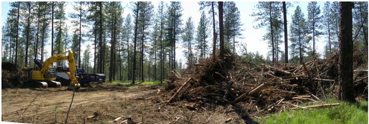
Figure 4: Processing equipment